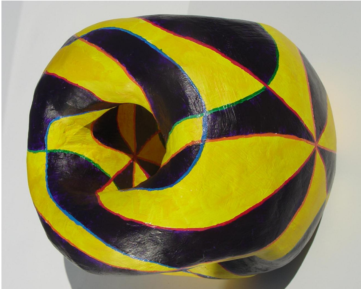
Figure 3 – Artistic Model of G

blue or green curves to be drawn, but not the other color. Finally, the yellow curves must be drawn onto the correct pillar and only then does the model work. The correct model is shown in Figure 2. This model has been verified by putting the correct group element into each region and verifying that all regions are adjacent to the proper region. Finally, it remains to construct a more artistic model of the compact surface.